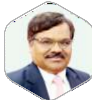
Vice-Chancellor, Sharda University